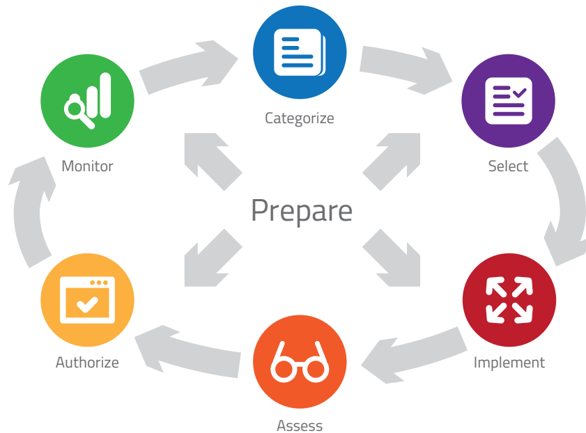
Risk Management Framework

K_Street follows the NIST 800.37 risk management frame model in its process and can provide this guidance on an annual basis. By reviewing our historical records with your firm, we can streamline the process each year saving you time and money.